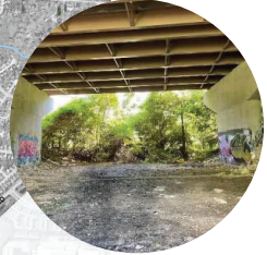
1 S.R. 161