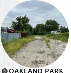
5 OAKLAND PARK