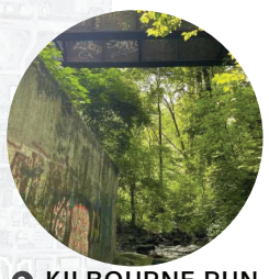
2 KILBOURNE RUN